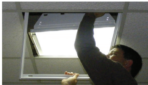
Place the fixture on top of kit frame.